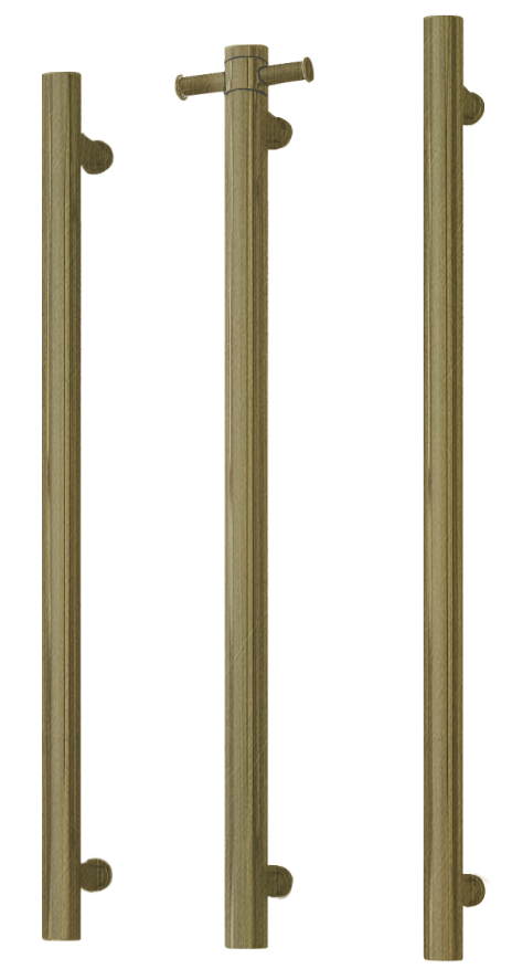
Rails shown in Antique Brass